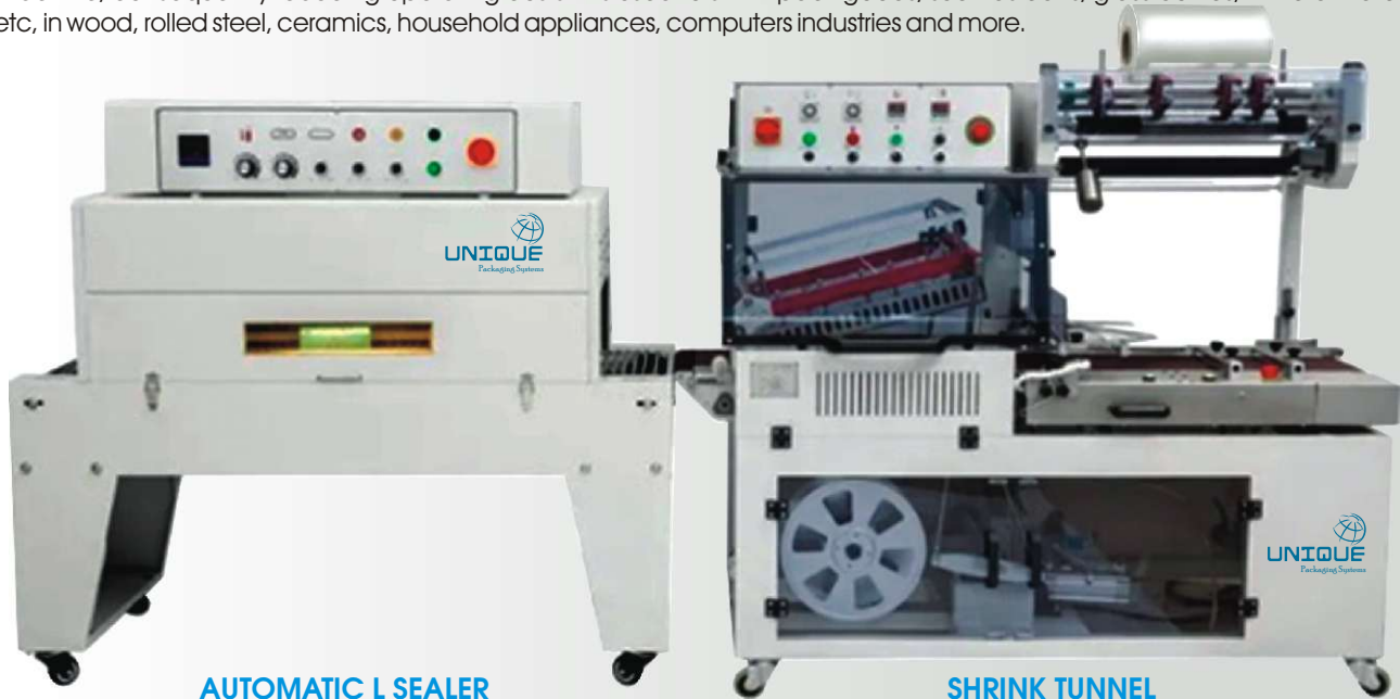
AUTOMATIC L SEALER

Shrink tunnels use a heated air system. It's used for shrinkable films like PE, POF, PVC that have been applied by L-bar sealers, sleeve wrappers, and sealing cutters. Designed for high production, the air flow technology is used to circulate the air to avoid bubbles and bumps in plastic film. Independent control systems regulate temperature, air velocity and conveyor speeds. Our shrink tunnels feature carefully controlled air velocity and temperature that are maintained throughout the tunnel for optimum film shrink. The efficient heating system on each machine reduces the amount of electricity needed to run the machine, consequently reducing operating costs. It is used to shrink pack goods, such as cans, glass bottles, mineral water etc, in wood, rolled steel, ceramics, household appliances, computers industries and more.